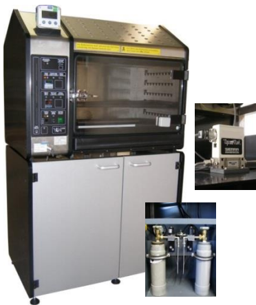
CON 300-FL with electronic dosing system for SO 2