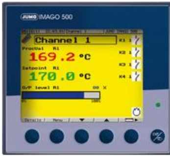
JUMO Imago 500