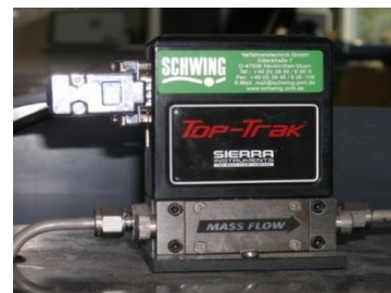
Casket with the SO 2 bottle and the electronic mass flow meter